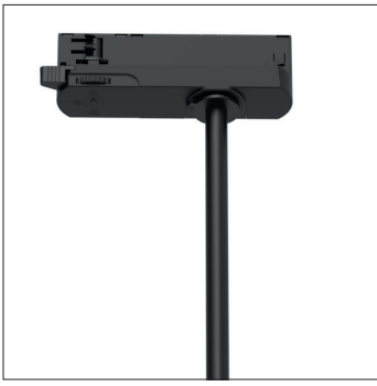
LP long mounting pipe 500 mm

All current index numbers, lumen outputs, power consumption and many other technical information are available in our 2024 pricelist. Details on wireless lighting control systems on page number 896.